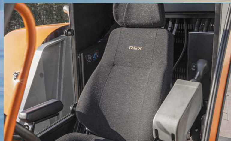
COMFORT OF WORK