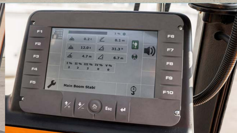
CONTROL AND SAFETY